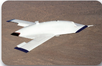
X-45 UAVs PC Card DTU