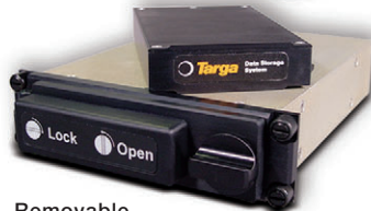
Removable Flash Disk DTU