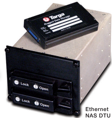
Ethernet NAS DTU