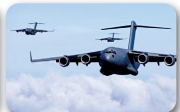
C-17 VME Flash Disk

Use of U.S. DoD imagery does not imply or constitute DoD endorsement.