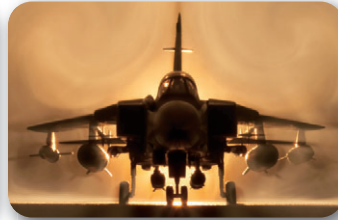
Tornado Removable Flash Disk DTU