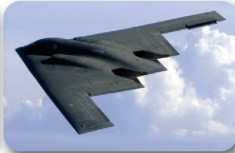
B-2 Stealth Bomber PC Card DTU