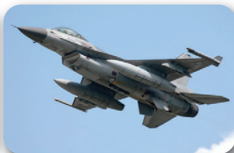
F-16 Removable Flash Disk DTU