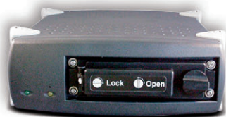
Removable Disk Desktop Unit