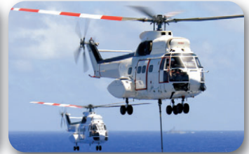
AS332 Super Puma PC Card DTU