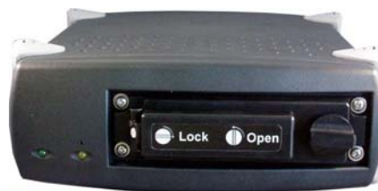
Ground Station Unit