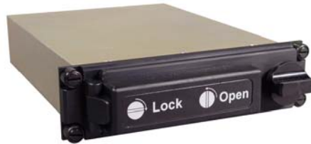
Panel Mount Data Transfer Unit (DTU)