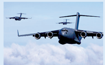
C-17 VME Flash Disk

Use of the U.S. DoD Imagery does not imply or constitute DoD endorsement.