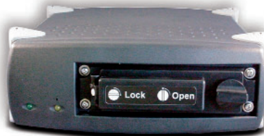
Removable Disk Desktop Unit