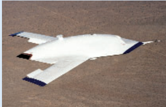
X-45 UAVs PC Card DTU