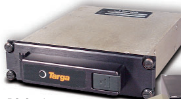
PC Card Data Transfer Unit