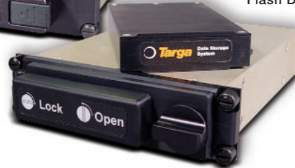
Removable Flash Disk DTU