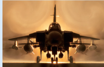
Tornado Removable Flash Disk DTU