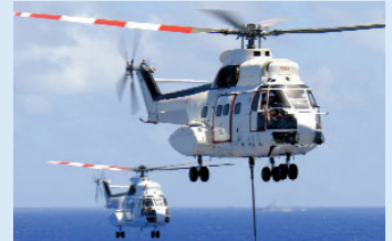
AS332 Super Puma PC Card DTU