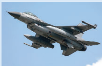
F-16 Removable Flash Disk DTU