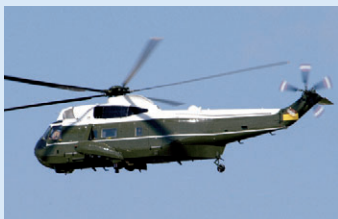
Sea King AEW MK7 PC Card DTU