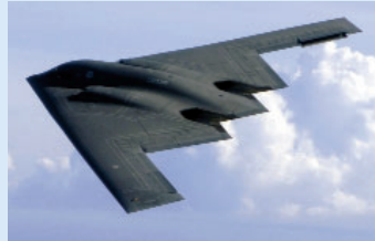
B-2 Stealth Bomber PC Card DTU